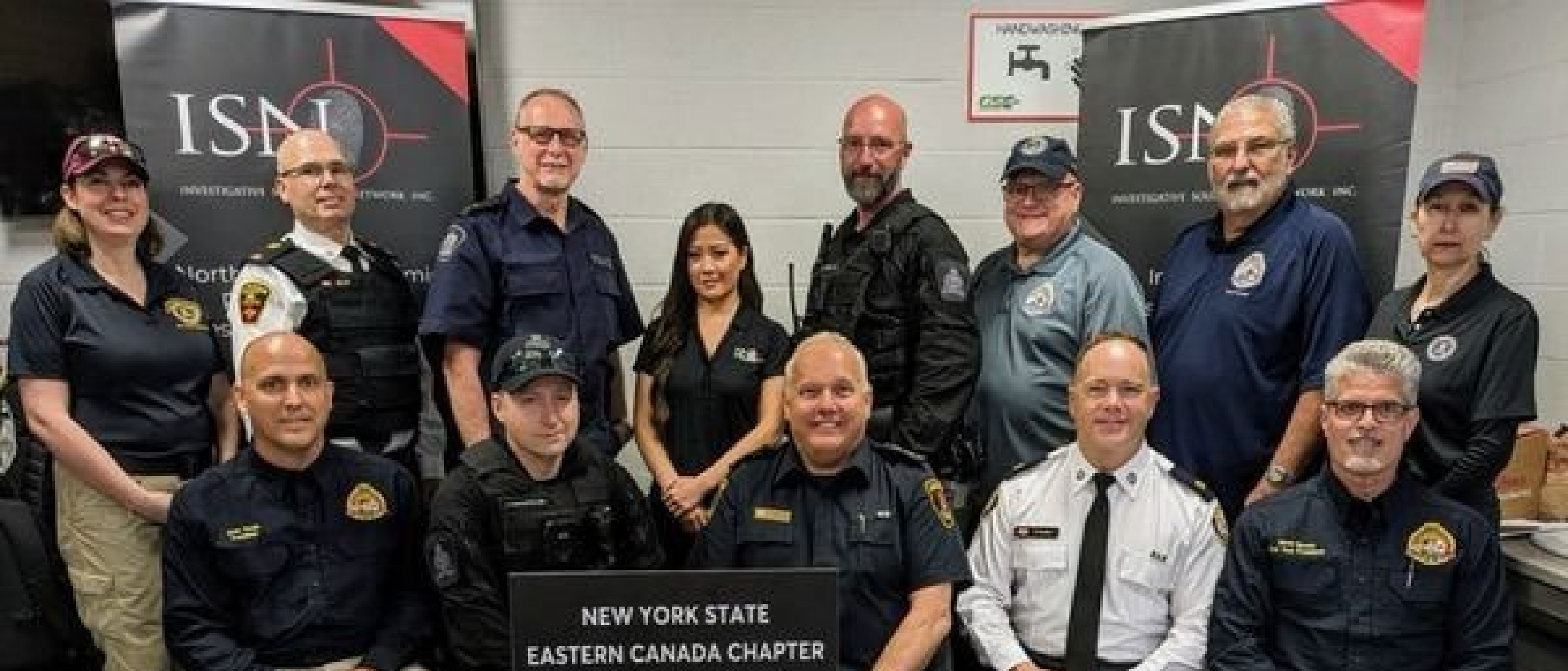
FBINAA New York State Eastern Canada